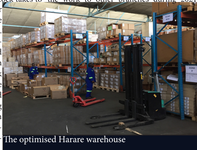
The optimised Harare warehouse

an order. As one result, for the first time in many years, the Harare Store completed a quarter ZAPS distribution on time in the quarter which ended in December 2020. And has accomplished the same for both Q1 and Q2, 2021. Importantly, the physical organization of inventory has also contributed significantly to reduce the number of variances, a long-standing and major challenge. Of course, there is always room for improvement, so the Warehouse Optimization work will continue. It is also planned to expand the work to other branches during 2021.