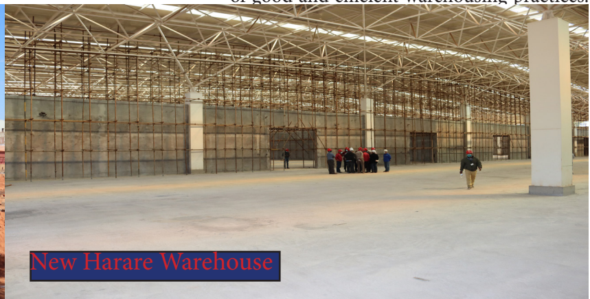
New Harare Warehouse