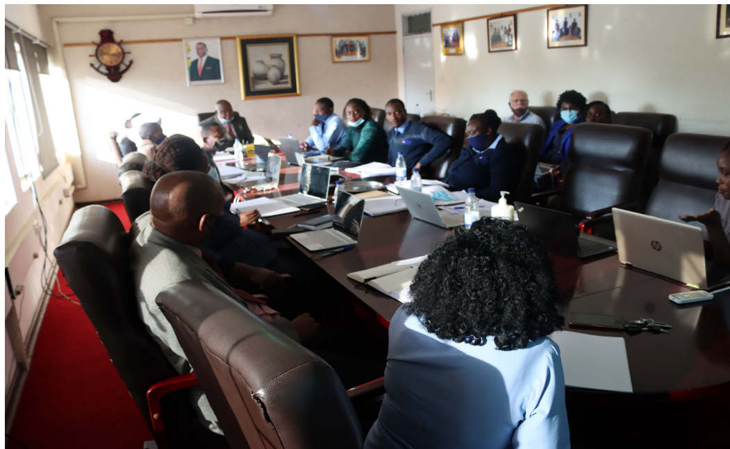
Pharmaceutical Association of Zimbabwe members convene a meeting at NatPharm Head Office in Harare.

THE National Pharmaceutical Company Zimbabwe (NatPharm) is committed to assisting local pharmaceutical companies in sourcing Active Pharmaceutical Ingredients (APIs) in a bid to boost their production capacities. In a meeting held with Pharmaceutical Association of Zimbabwe at the NatPharm Head Office in Harare recently, the state enterprise said it was working on assisting local companies in sourcing