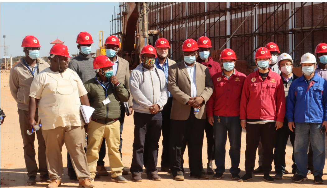
NatPharm Management, UNDP staff and Chinese contractors pose for a photo on the sidelines of a tour of the new State-of-the-Art Warehouse in Harare

NatPharm gives priority to local manufacturers in sourcing all its medicines and medical supplies requirements. NatPharm has embarked on revamping its production units in an endeavour to produce medicines complementing the efforts of companies in line with the local industrialisation thrust.